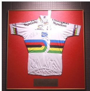
(1) Display of the cyclist champion-Mr Wong Kam-po's cycling jersey