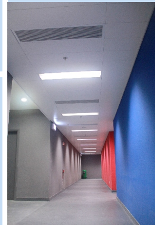
(5) Concealed grids hook-on ceiling panels at corridors

負責這次項目的主建築師巴馬丹拿與斐索合作為將軍澳室內單車場及體育館設計多種不同的金屬天花：包括用於室內公用部分的沖孔吸音垂片天花、室外的無沖孔垂片天花、多用途活動室和走廊的掛鉤天花及場館正門外的防風掛鉤天花。