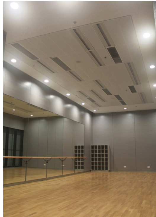
(4) Perforated hook-on ceiling panels in 300 x 1200 mm at dancing room and gymnasium