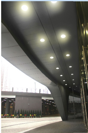
(2) Demountable typhoon proof ceiling at main entrance