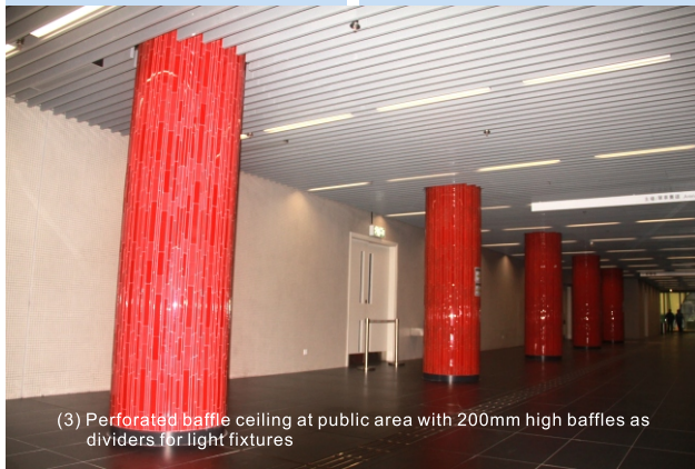
(3) Perforated baffle ceiling at public area with 200mm high baffles as dividers for light fixtures