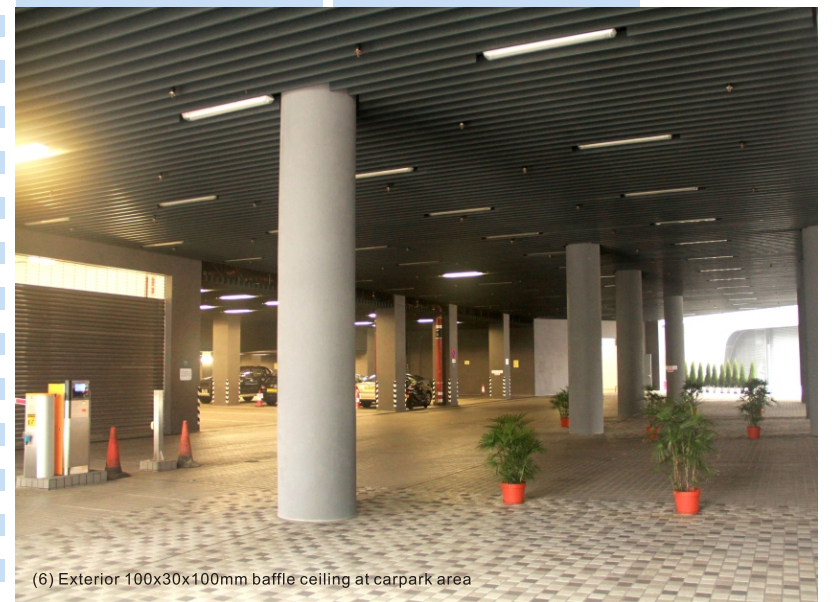
(6) Exterior 100x30x100mm baffle ceiling at carpark area